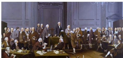
The Signing of the United States Constitution by Louis S. Glanzman, 1987 Commissioned by the PA, DE, NJ State Societies, Daughters of the American Revolution, Independence National Historical Park Collection.

There are a lot of well-meaning legislators pushing for an Article V Constitutional Convention. This process allows for delegates from across the country to crack the hood (so to speak) on the Constitution and make "adjustments".